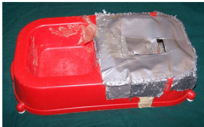
Duct Tape Prototype

Sherman came from an animal shelter. He wasn't the prettiest cat, but he was the friendliest. We found that he did have one fault: he loves to eat, would eat his meals as fast as possible, then beg for more. Soon he had put on quite a bit of weight. He weighed in at the vet's office at 13 pounds, which is about 30% above what it should be. Our veterinarian told us that Sherman needed to lose weight. She said that the excess weight can cause serious health issues.