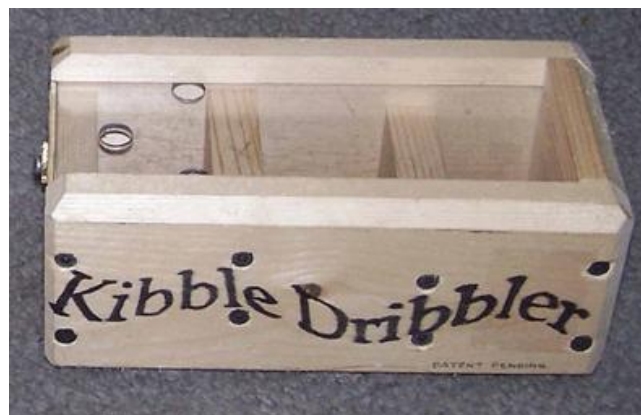
Today's Kibble Dribbler

I went into my workshop and, using what scraps of wood, plastic, and metal I could find, built the first Kibble Dribbler. Sherman quickly learned to lift, pull, push, and tumble his Kibble Dribbler, making him more active and lengthening his feeding time from about a minute to nearly half an hour. After a little more than a year, Sherman had dropped to 9-1/2 pounds, which our vet said was "ideal" for his frame.